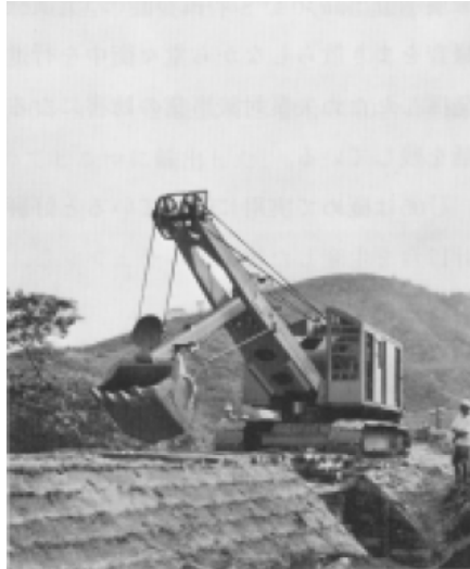
U05 cable-operated power shovel

Development of the HITACHI U05, the first cable-operated power shovel made entirely from Japanese technology