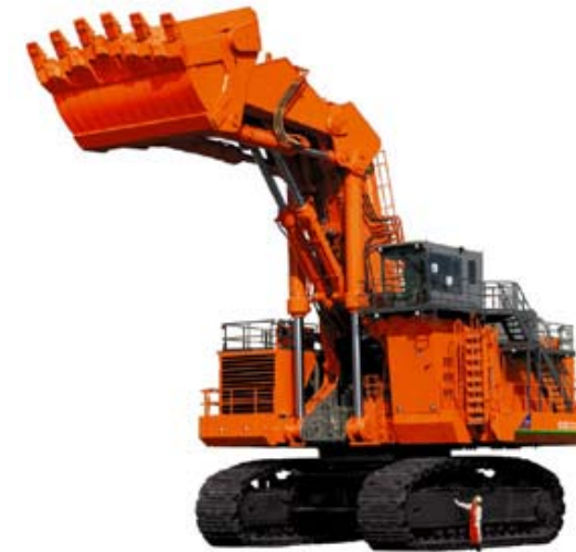
EX8000 ultra-large hydraulic excavator

Developed the EX8000, world's largest class of ultra-large hydraulic excavators